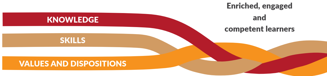
Figure 1: The components of key competencies and their desired impact

Key competencies is an umbrella term which refers to the knowledge, skills, values and dispositions students develop in an integrated way during senior cycle.