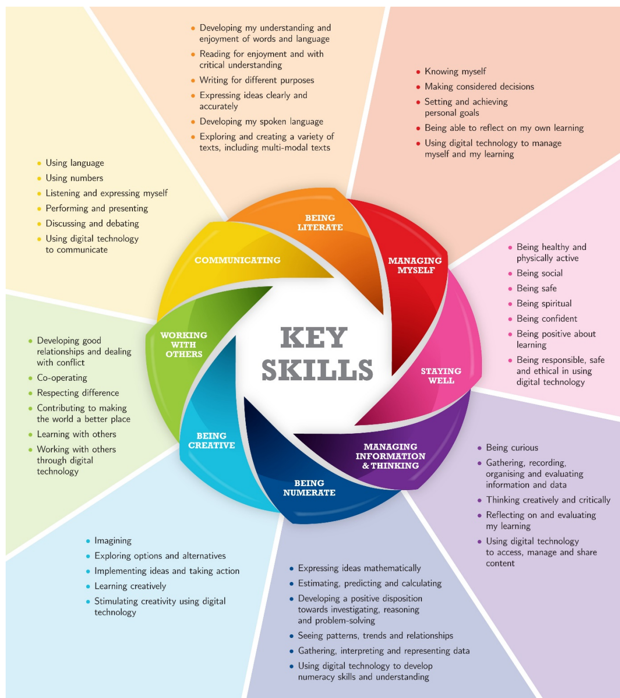
Figure 1: Key skills of junior cycle

In addition to their specific content and knowledge, the subjects and short courses of junior cycle provide students with opportunities to develop a range of key skills. The junior cycle curriculum focuses on eight key skills.